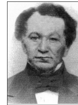
Photo of unidentified man