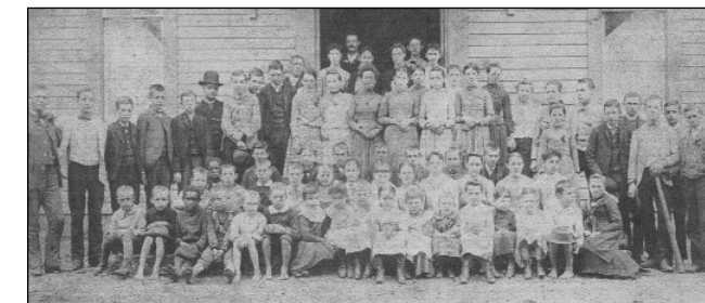
Picture of the Randolph School Students in 1889.